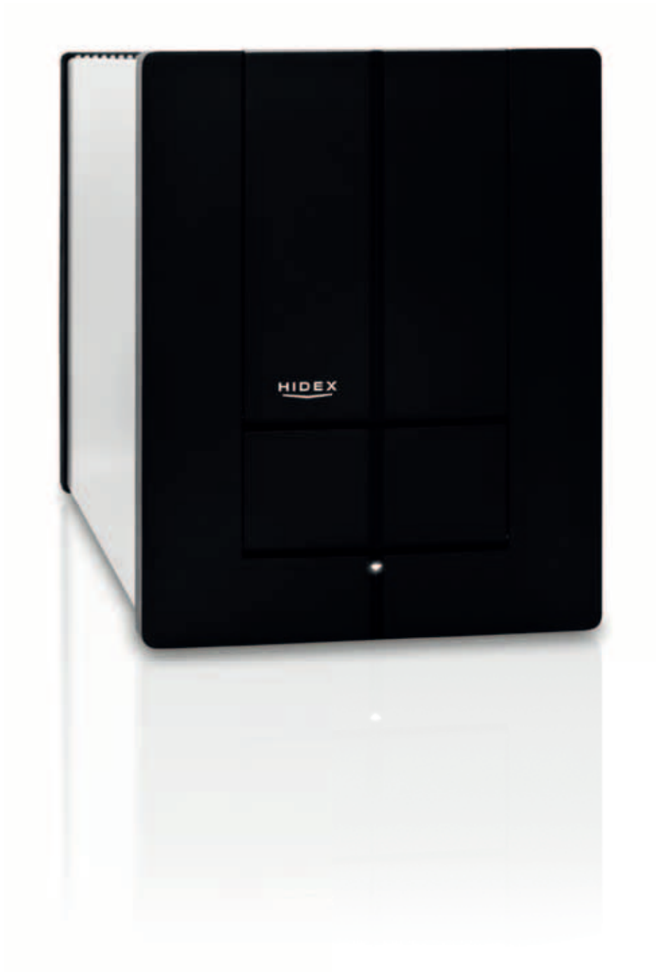
Hidex Sense Microplate Reader